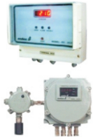
2620 WP / 2620 EX SERIES