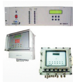
SC - 5101

24V DC Power SUPPLY Indicating / Non - indicating Weather / Ex Proof versions Analog or Digital RS 232 / 485 output, Modbus