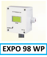
EXPO 98 WP

Modular Construction Rack Mounting, Analog input from Transmitters Adjustable Alarms 24 Volt DC output 4-20Ma Analog / Digital Output, Relay output Modbus