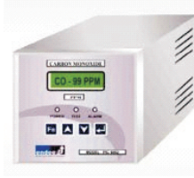
PIC - 6002 SERIES

Wall Mounting Integral or remote sensor Adjustable Alarms Relay Output Analog & Digital output Modbus