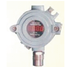
EXPO 98 WX